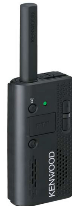
UHF FM TRANSCEIVER PKT-03